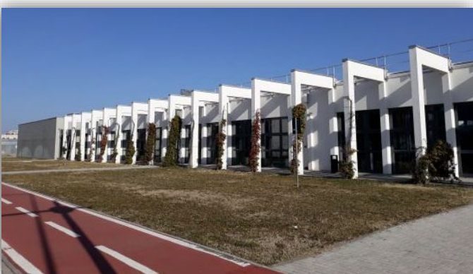
Aule delle Scienze