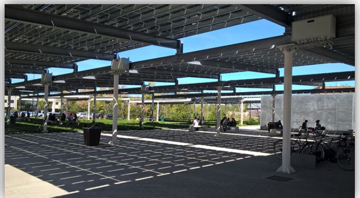
Photovoltaic square in front of the Conference Center