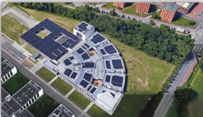
Aule delle Scienze Buildings